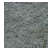
Sterling Special Order