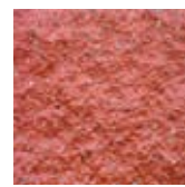
Cinnamon Special Order